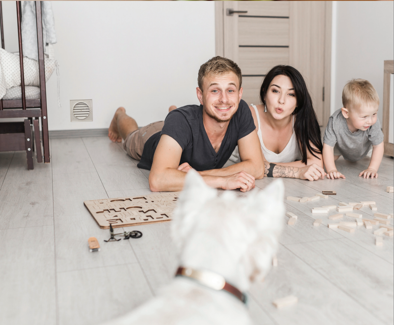
IN THE LIVING ROOM