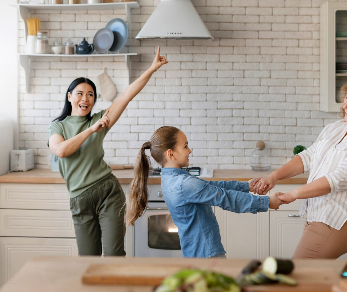
IN THE KITCHEN